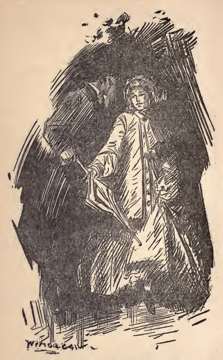
"'All right,' she said; 'then I suppose I shall have to take it.'" [Page 88.]